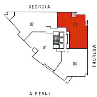
FLOORS 46-47 55-57